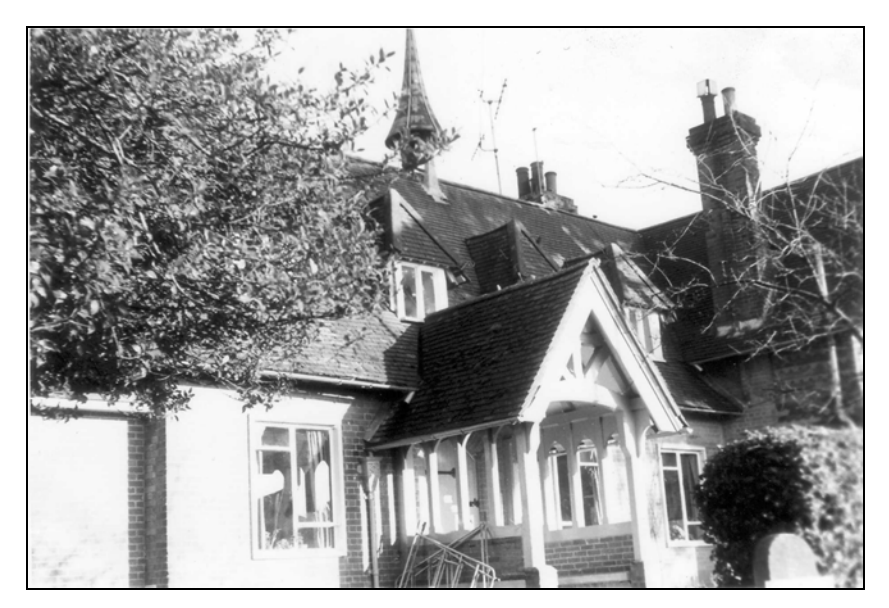
The school entrance, 1966