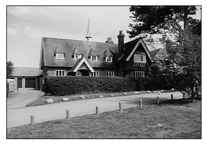
The school as a private house

done with the proceeds. A file in the parish archives shows that this involved many parties, including the school's trustees (the rector and churchwardens), their solicitors (Morrisons in Reigate), Buckland Parish Council, the Buckland Estate, the Southwark Diocesan Board of Education, the Charity Commission, the Department of Education and Science, and the Secretary of State for Education. In order to continue the objectives of the original benefactors, the Parochial Church Council wanted to use the money for educational purposes, particularly in the locality, and to form a Trust to administer the assets. The Diocesan Board of Education claimed that the money should be handed over to them to help other Church of England schools; but when the trustees and Parish Council, among others, pointed out that Buckland villagers had contributed the land and many thousands of pounds towards improving the school, the Diocesan Board agreed that the trustees retain ten per cent. Accordingly, in July 1987, 90 per cent of the proceeds – which, with interest, had by now amounted to over £105,000 – was paid to the Diocesan Board against a deed of indemnity which protected the school trustees from any future claims.