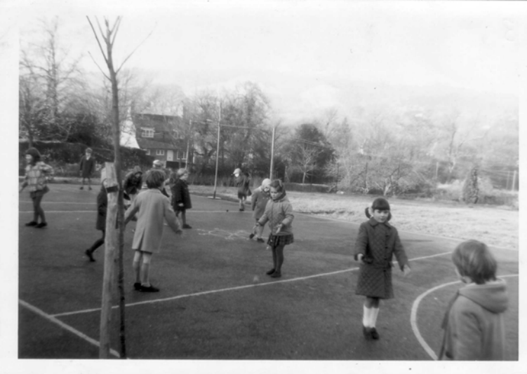
Infants playing in the playground by a frosty school field (left) and all the infants (below) in 1966